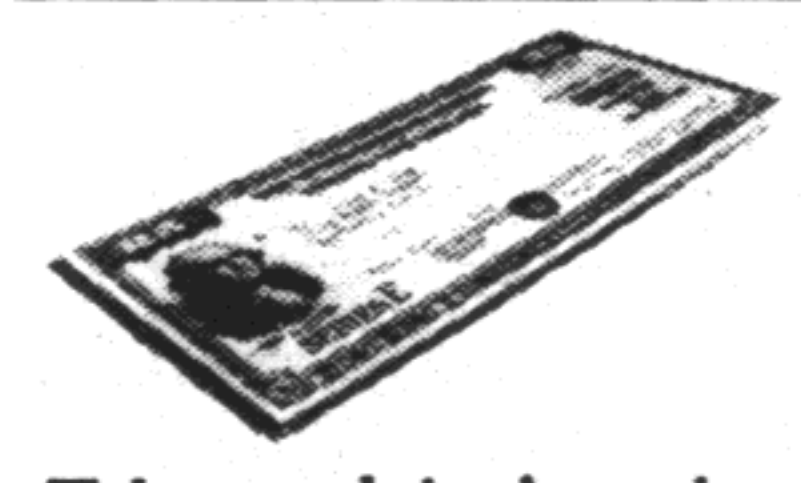
Take stock in America Buy U.S. Savings Bonds & Freedom Shares

Her career includes clinical nursing positions at Boston City Hospital, St. Ann's Hospital, Juneau, Alaska, and the PHS Alaska Native Medical Center in Anchorage.