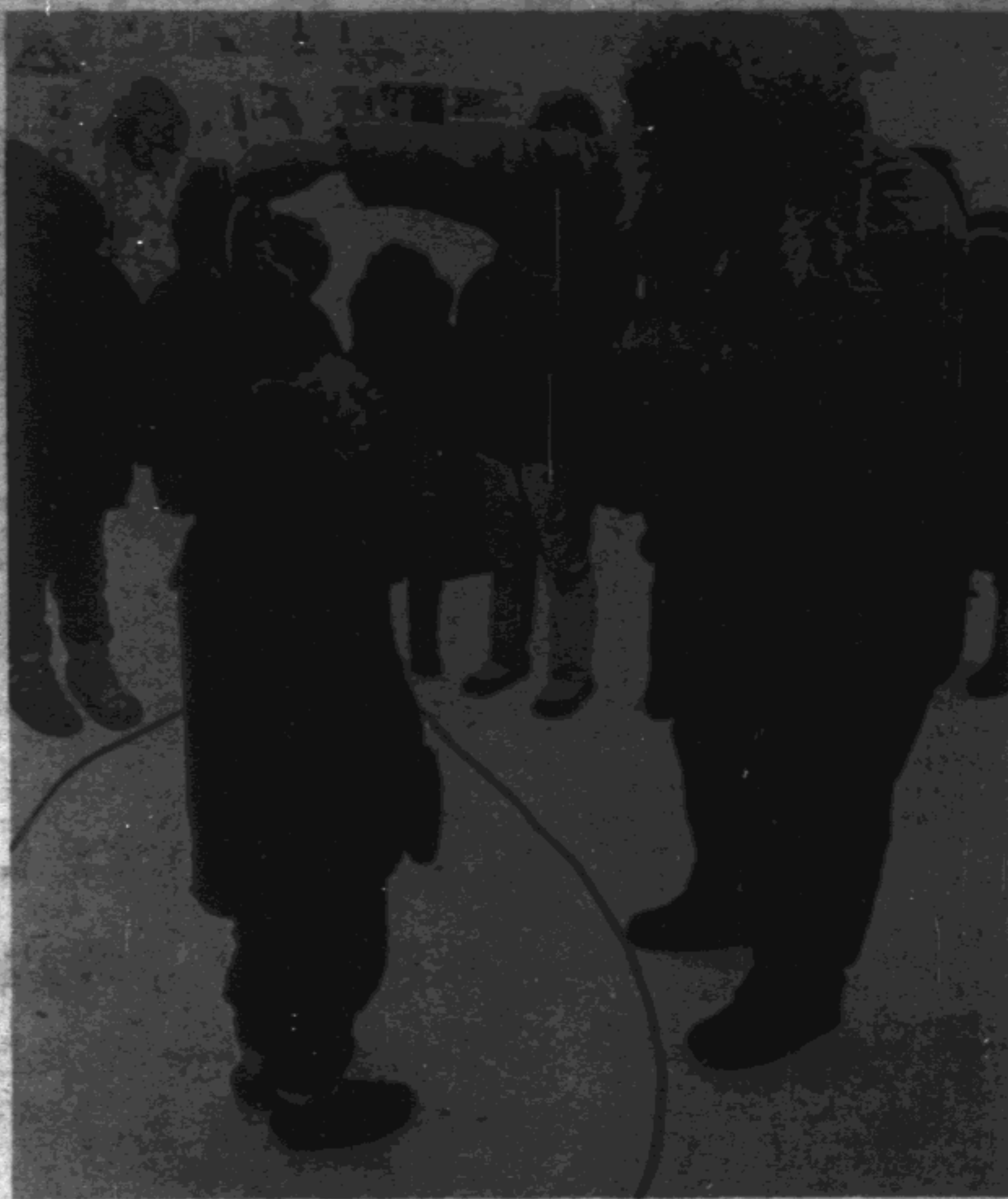
ROPING DEMONSTRATION —Will Rogers, Jr. demonstrates fancy rope twirling to an unidentified Wainwright youngster. Rogers commented that the art was rapidly dying, and only about a half dozen experts were left in the skill his father made famous.