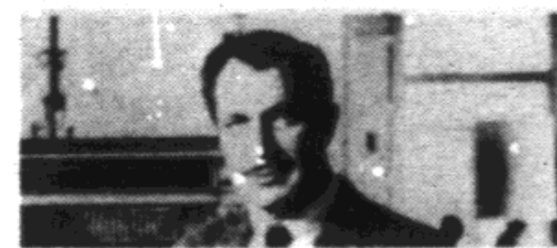
Introduction by Vincent Price

TUNDRA TIMES WILL PAY POSTAGE FOR BOOKS SENT OUT OF FAIRBANKS