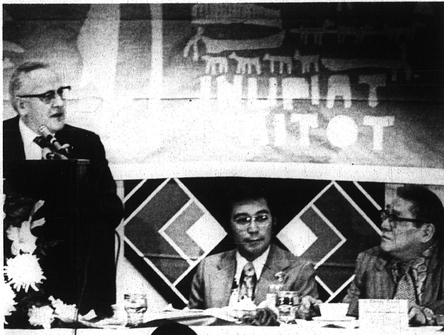
MAJOR POLICY SPEECH —Governor William A. Egan surprised and deeply moved the audience by delivering a major policy speech at the banquet. Listening attentively to the speech are,