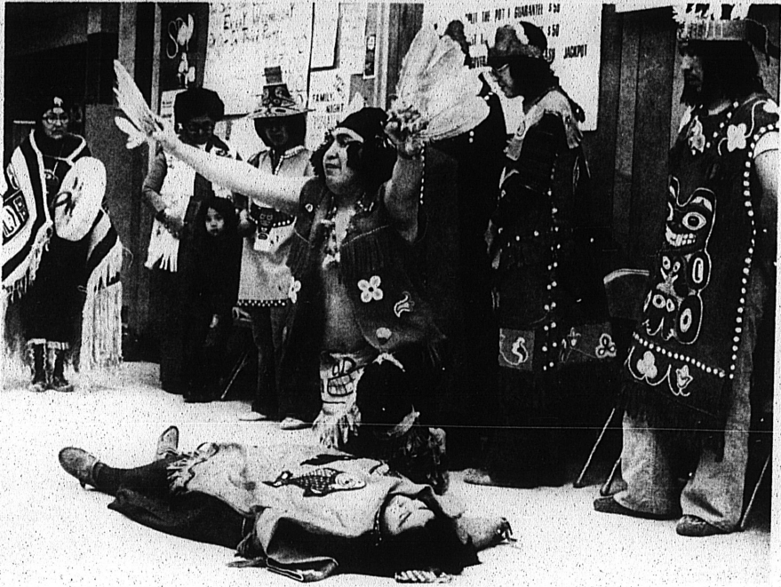
THE WITCH DOCTOR dance performed by the Tlingit group at the Cook Inlet Native Association Potlatch.