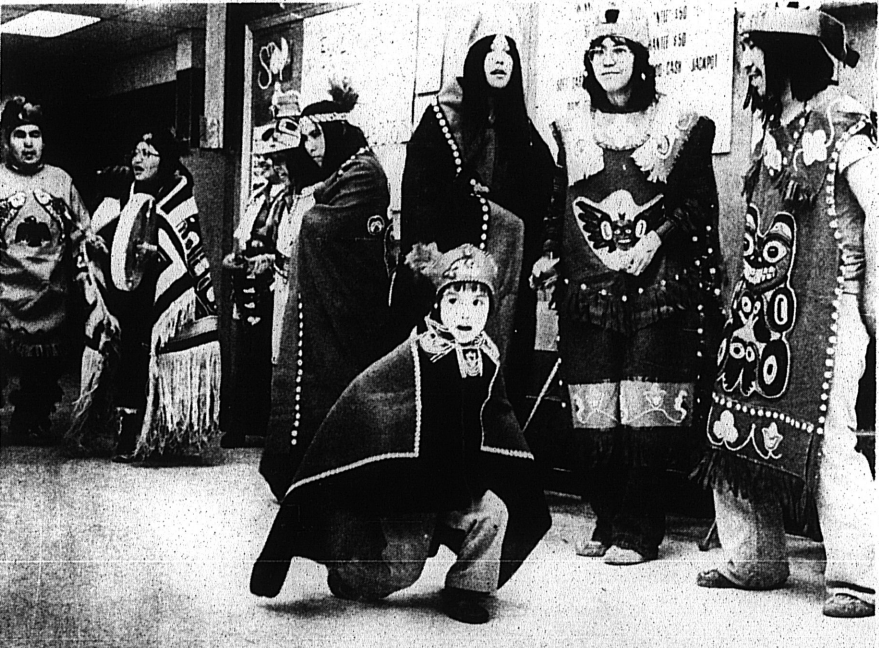
THE RAVEN DANCE—performed by the Tlingit group at the Cook Inlet Native Association Potlatch in Anchorage.