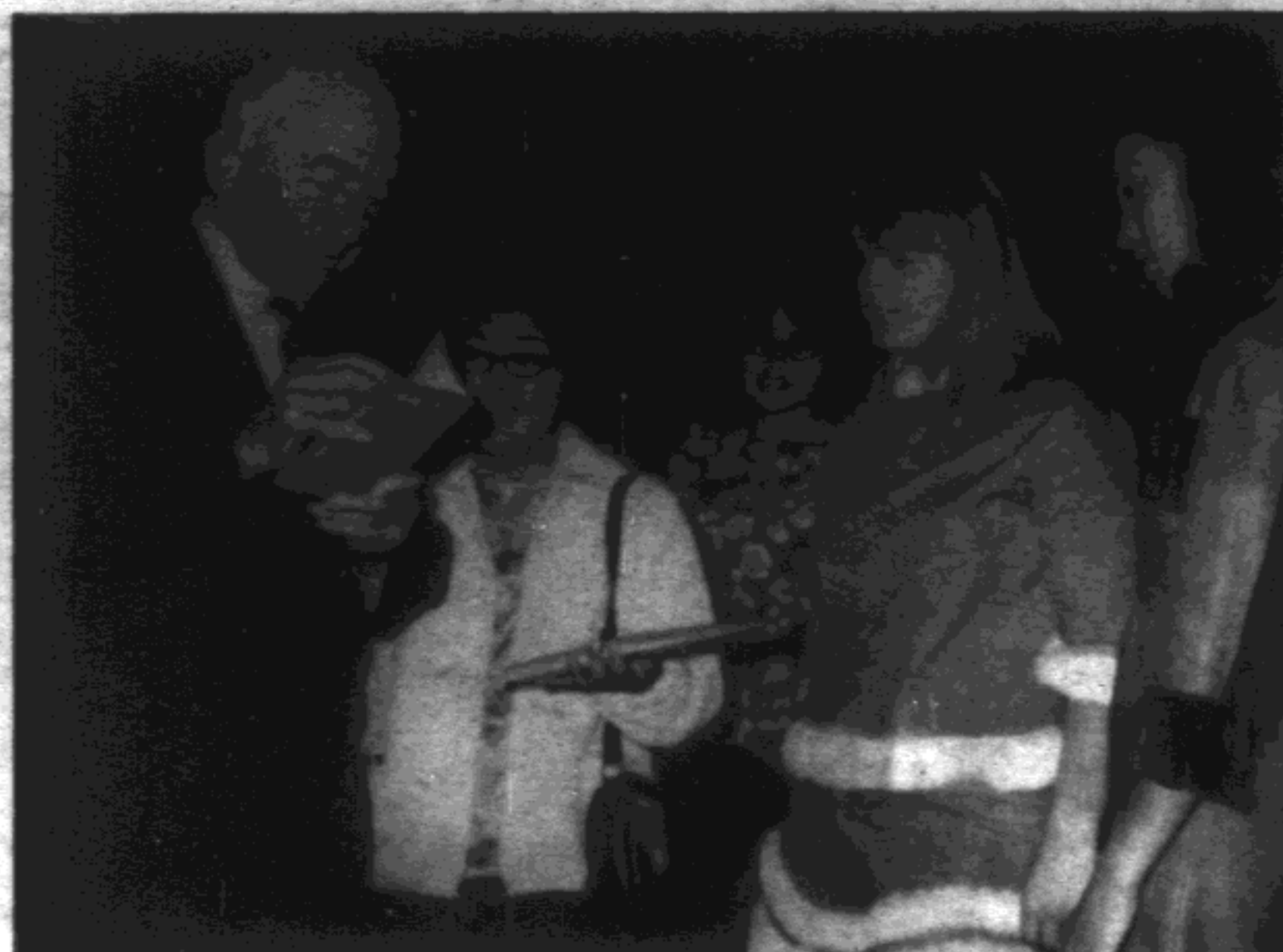
At young people's gathering in Anchorage.