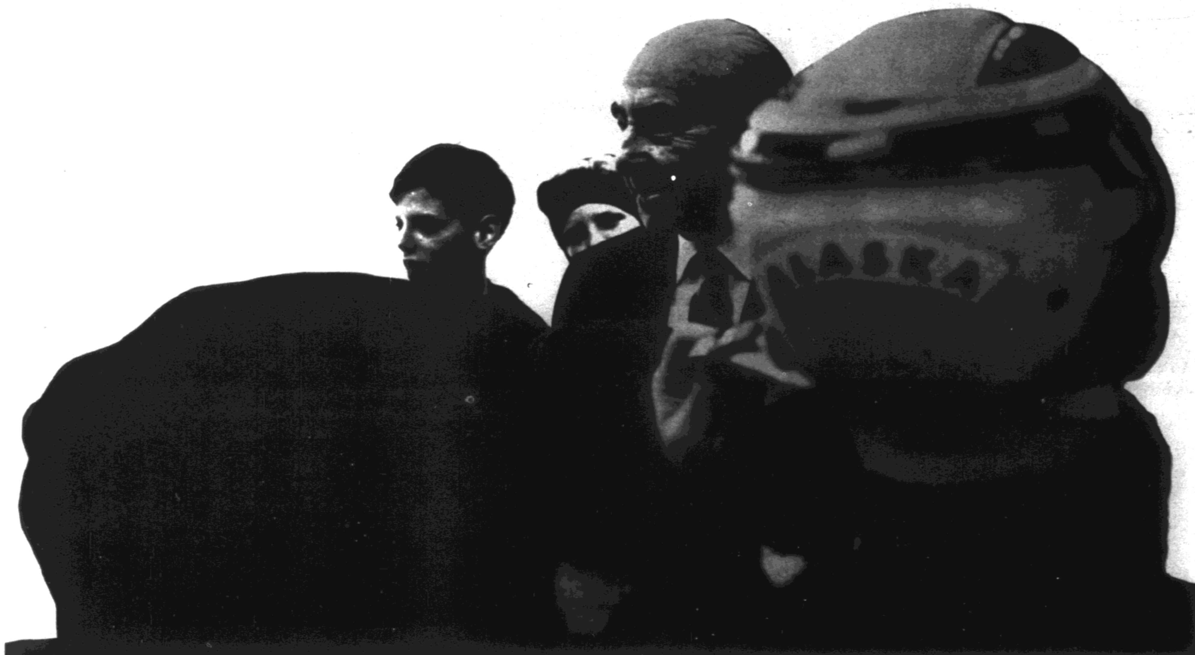
With visiting Anchorage hockey team in Washington.

A better future for Alaska's young people is the theme that runs through all Ernest Gruening's labors on behalf of the 49th State. Senator Gruening has often said that our young people are Alaska's greatest resource.