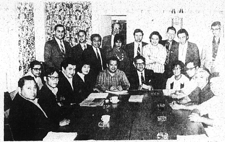
One of many Washington, D. C. meetings.