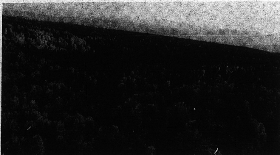
The Willow Site is characterized by birch, spruce and cottonwood forests.

Water fowl are not known to nest on the Willow site, although small ponds and lakes are occasionally frequented by migrating and feeding birds. Streams within the site are not known to have salmon runs, but do support fish native to the area.