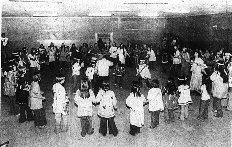
EVERY NIGHT Athaskan dancing and singing filled the community hall.