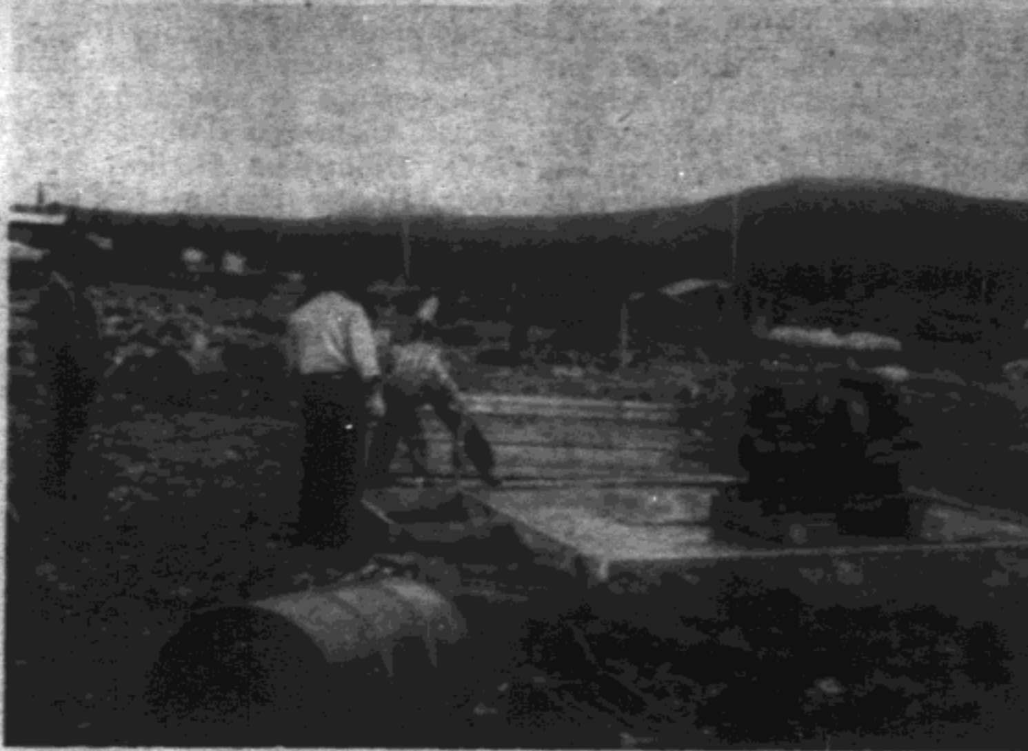
FOUNDATION—Elim village workmen begin work on the foundation of the Superette.