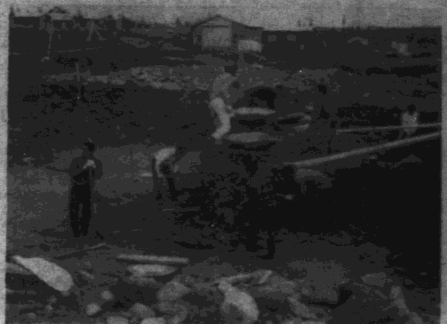
EXCAVATING—Elim village men are busily digging out the basement for the Superette.