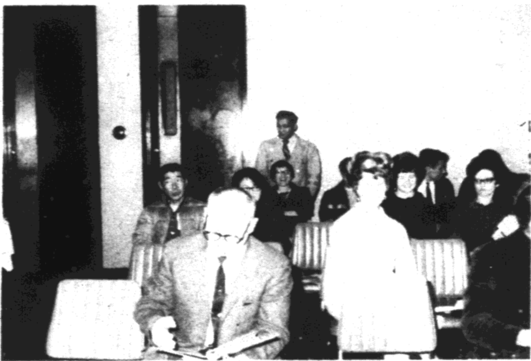
STAFF AND OTHER interested people gathered to watch the proceeding of the Board meeting.