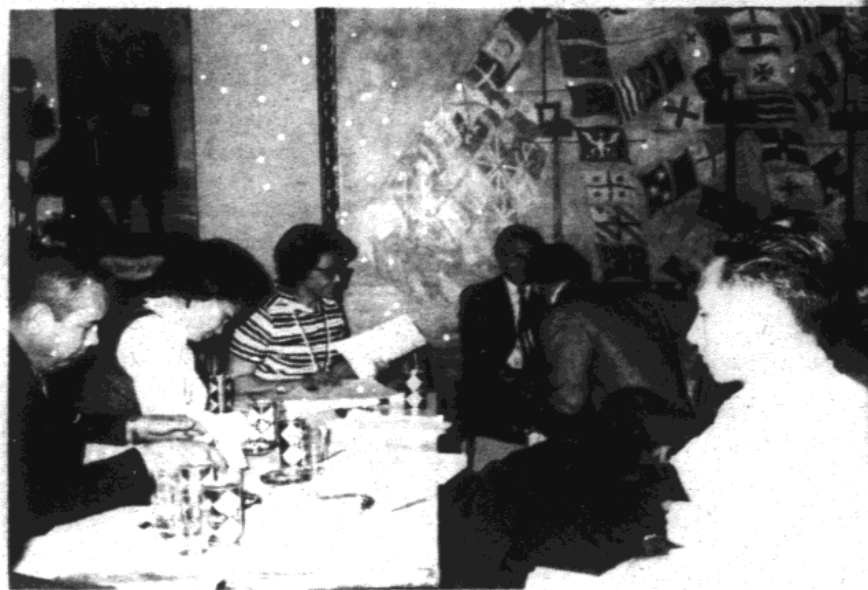
SEVERAL "executives" meet informally to discuss the coordination of the program for 1970.

During the two-day meeting the Board also considered the application by the Kodiak Region to become a delegate agency of RurALCAP.