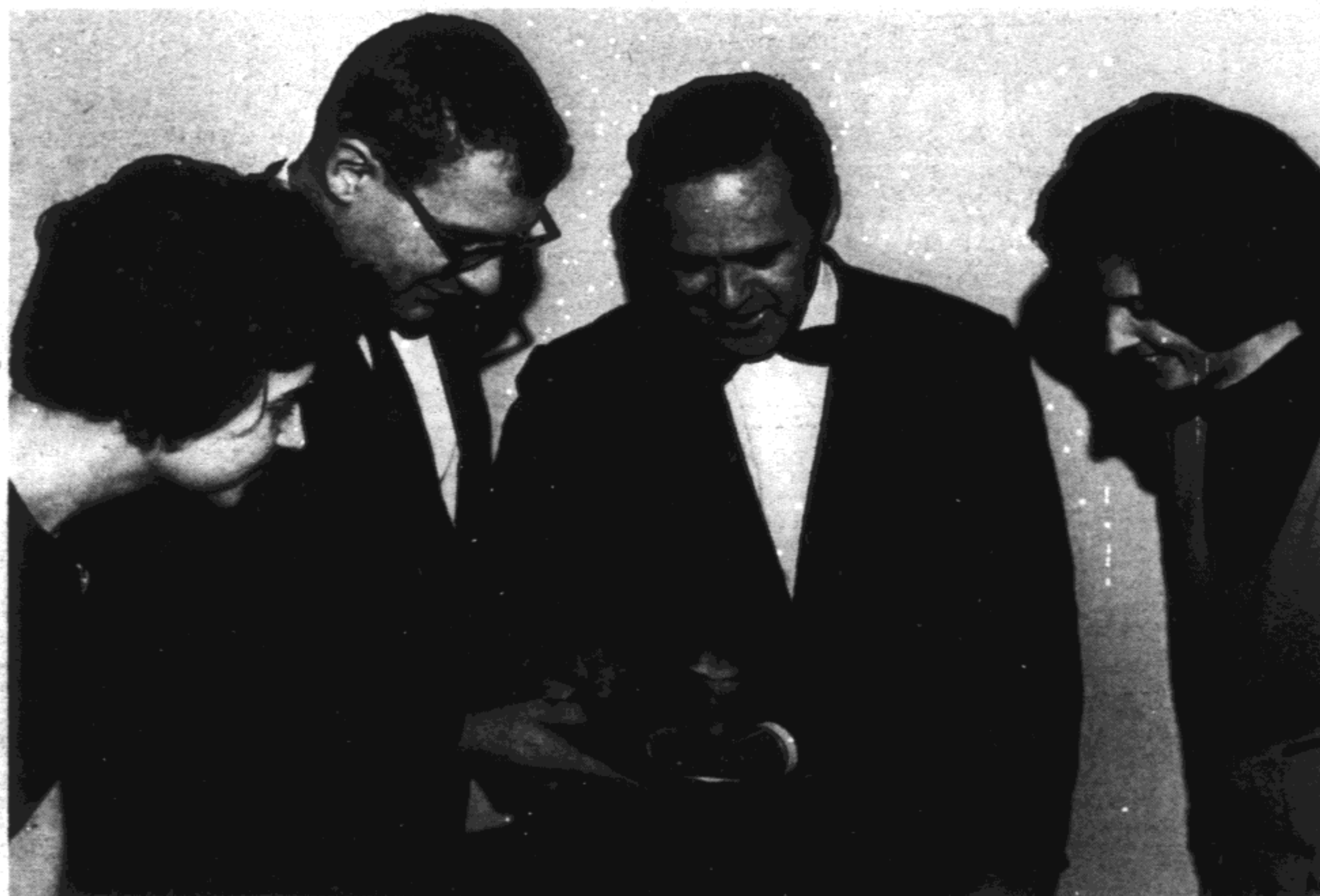
JUNEAU—A Fairbanks, Alaska miner utilized the true Alaskan way to pay a $1,250.00 loan payment with the Division of Veterans' Affairs. He made payment in gold nuggets from his mine. Gold nuggets, used by jewelers in the manufacture of Alaskan jewelry, sells for $75.00 an ounce in