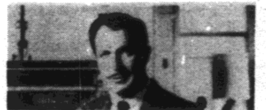
Introduction by Vincent Price