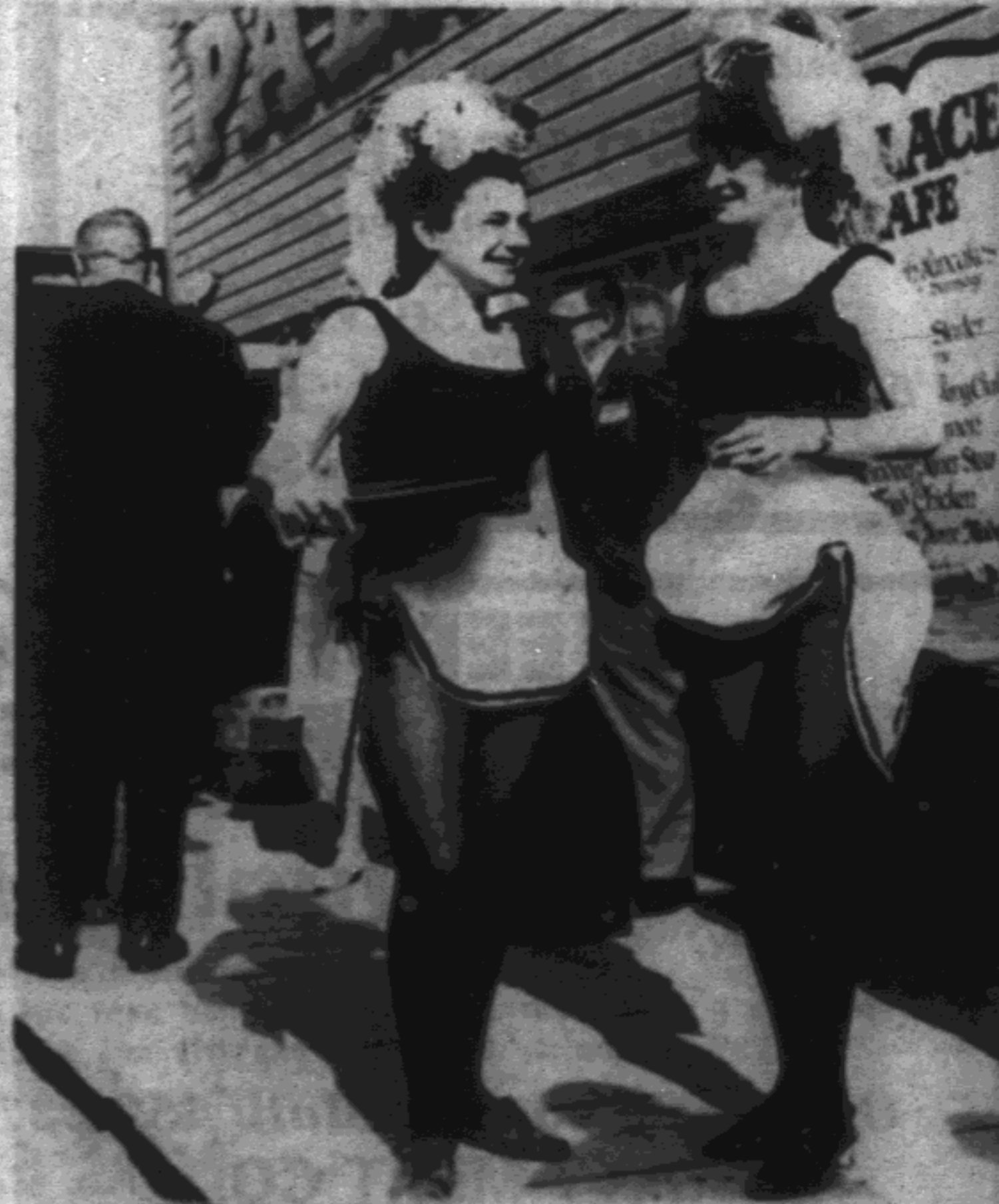
CAN-CAN GIRLS—Can-can girls at the Palace Saloon wait on the customers.

The new twin jet 737 model can land on shorter fields than its larger counterparts. It cruises at speeds up to 550 miles per hour.