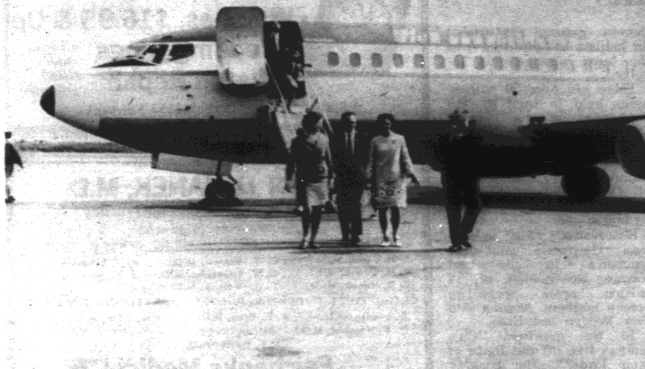
DIGNITARIES DEBARK—Leading citizens of Anchorage begin to come off the Wien