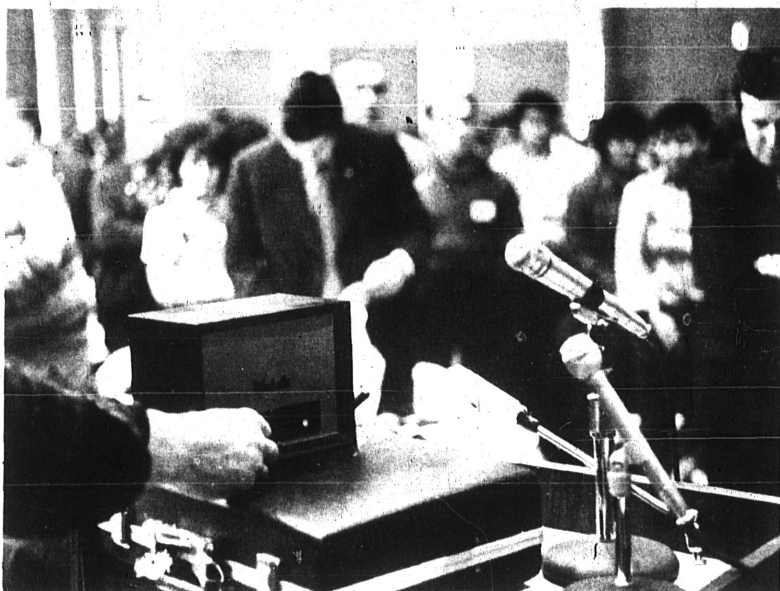
THE PRESIDENT'S WORD—As a technician adjusts the receiver, AFN convention delegates rise to listen to greetings from the President of the United States, Richard M. Nixon, on Native Land Claims.