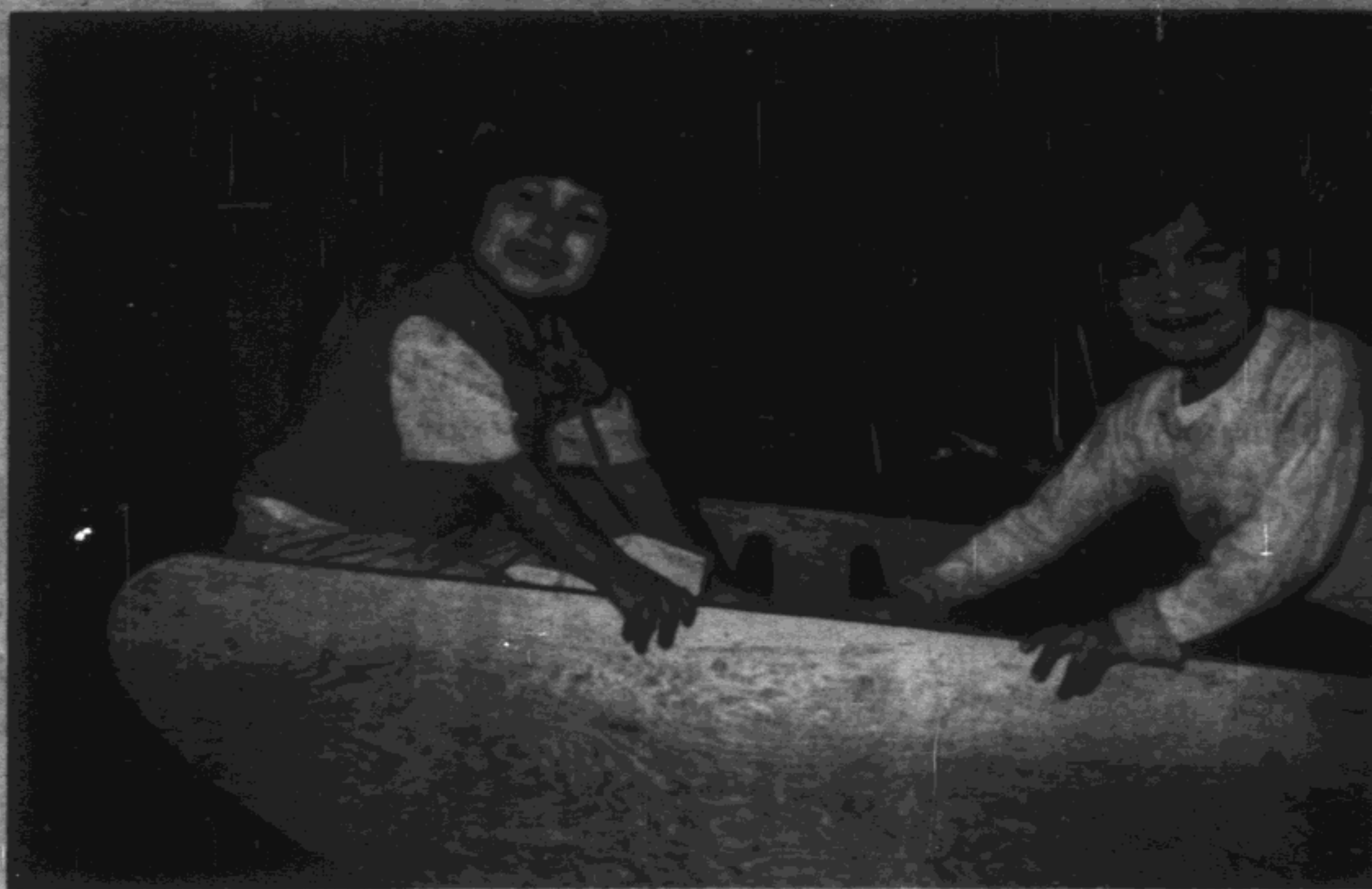
KALTAG —Kaltag village youngsters rock the time away during Head Start session.