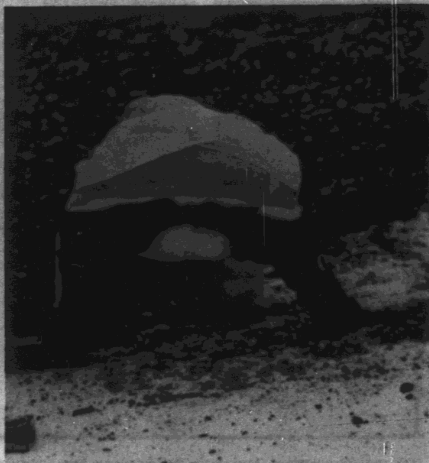
GAMBELL —Rear view of a hard working Head Starter.