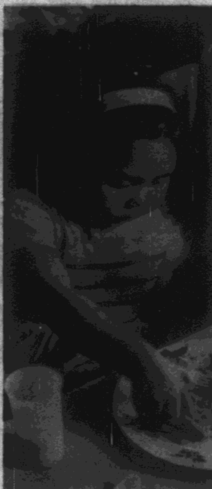
HANDS ARE BETTER —Little girl from Gambell discards her knife and fork to eat her wiener.