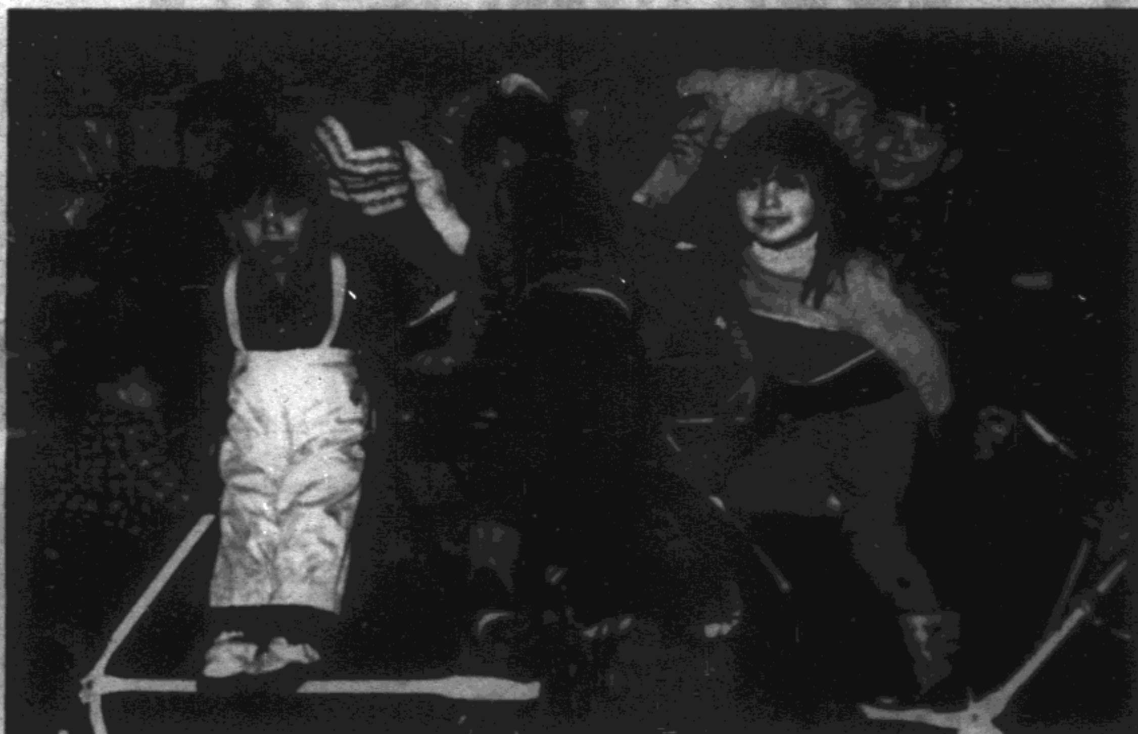
KOYUKUK —Geodesic climbing dome keeps Head Starters busy.