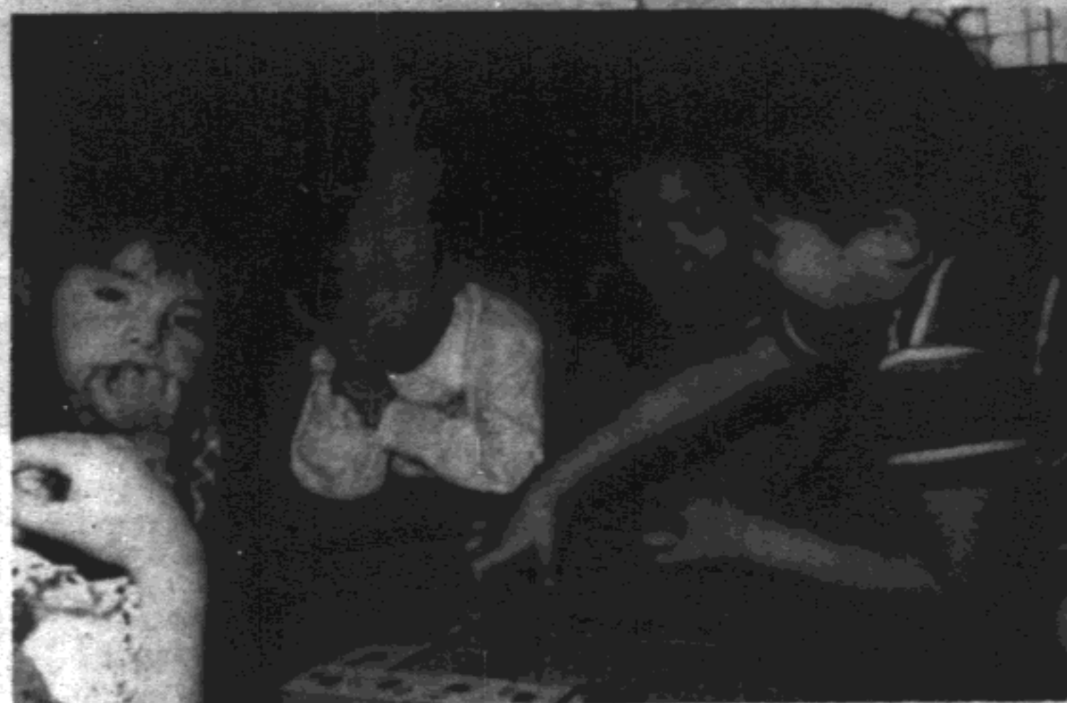
NULATO —Little Athabascans relax with a game of picture dominoes at the village of Nulato.