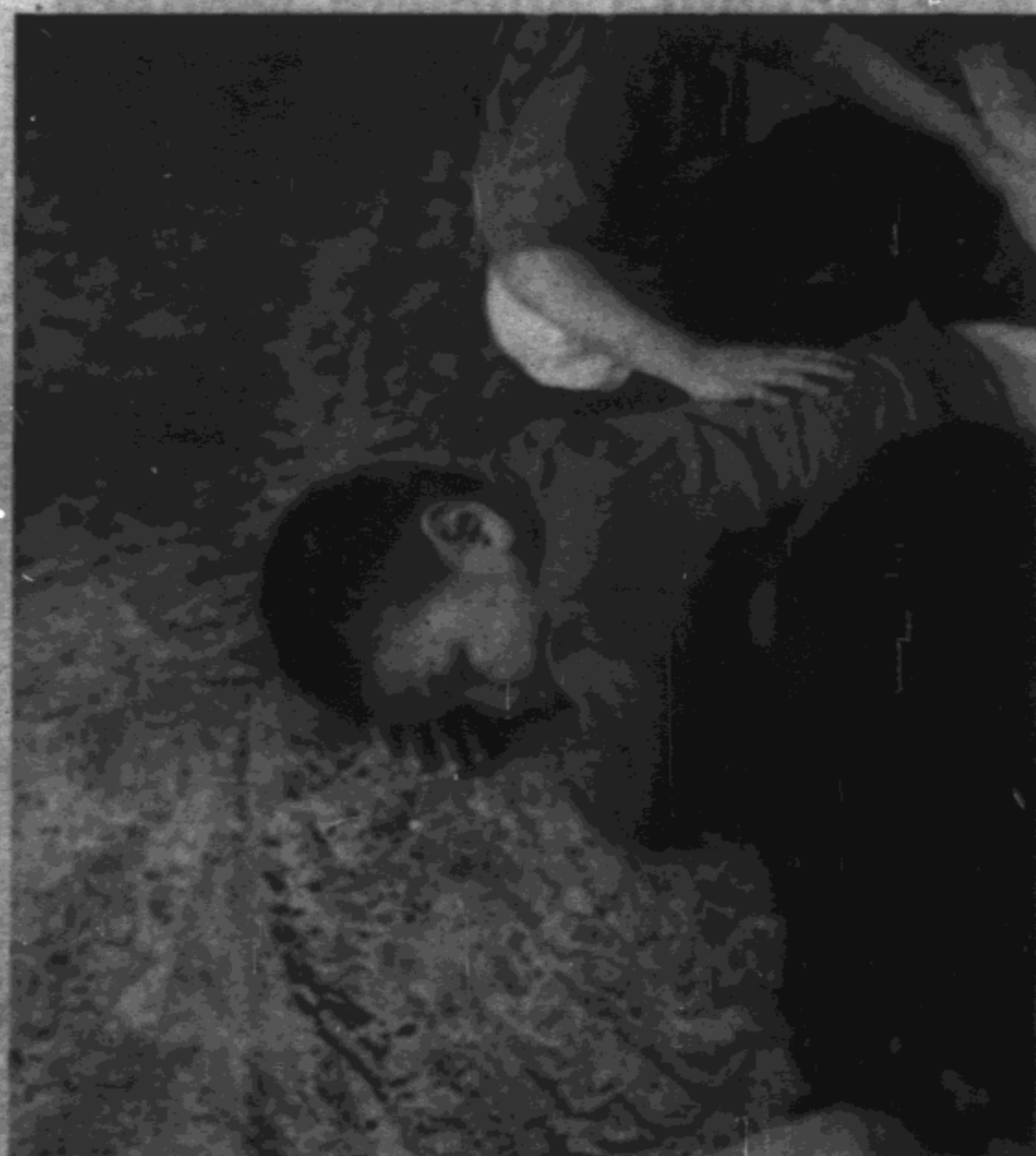
AFTER HARD STUDY —Gambell youngster is taking a rest cure after a hard session.