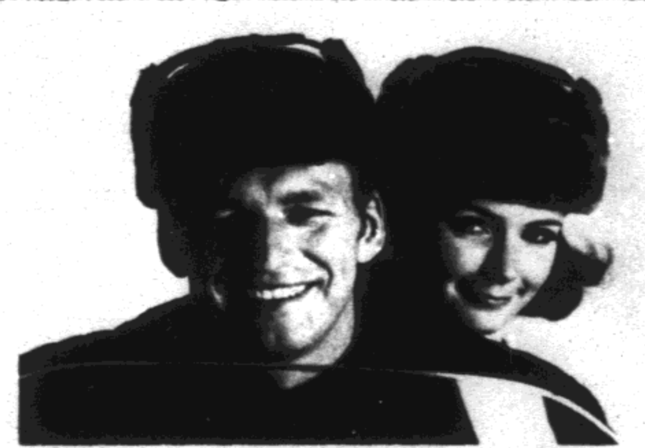
PLAY WINTER SAFELY