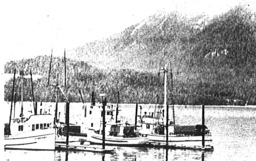
FISHING FLEET — Shown is part of the Petersburg fishing fleet awaiting activities in the future.