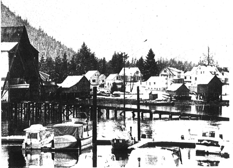
CONVENTION CITY — The City of Petersburg in Southeastern Alaska was the scene of the annual convention of the Central Council of the

Tlingit and Haida Indians of Alaska last week.