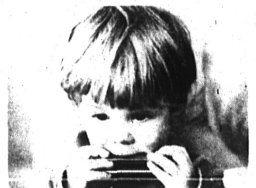
CHILD at Eneput Center.

Tell your friends about the "Break-up Celebration."